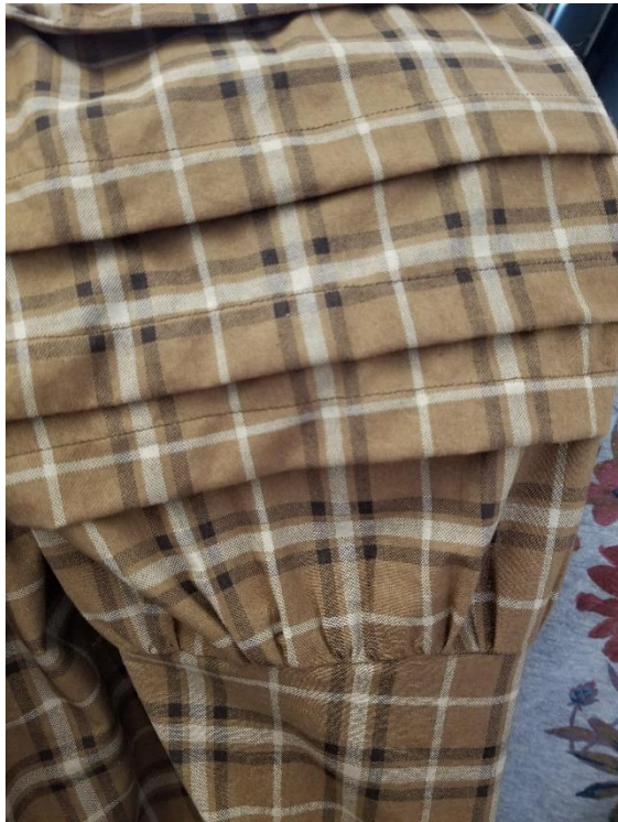
Divine Puffed Sleeves – Kristen Kiel

https://membersFOUNDATIONSrevealed.com/competitions/divine-puffed-sleeves/