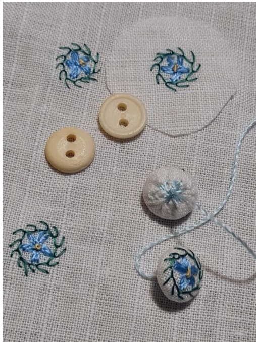
Nokken the Water Spirit – Salme V

https://membersFOUNDATIONSrevealed.com/competitions/nokken-the-water-spirit/